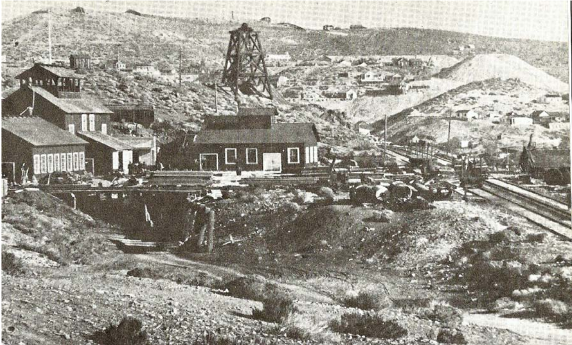
FIGURE 3 BELCHER MINE

market conditions. Both mines continued to produce and to pay dividends as the rest of the Comstock struggled. 9